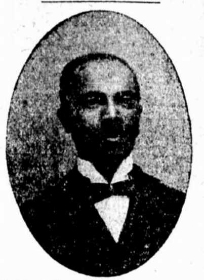
RUSH FOR MUNICIPAL JUDGE.