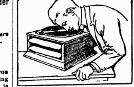
Holding a Needle in the Teeth, a Phonograph Record Can Be Heard. N. B.—The Lips and Tongue Must Not Touch the Needle.

An interesting experiment that proves what a good sounding box the human skull is can be performed by anyone who has a disk phonograph. It is described by H. Gernsback in the Electrical Experimenter as follows: "Stop up both of your ears with cotton as tightly as possible, so that no sound will be heard from the outside. Now place an ordinary darned needle between your teeth by biting on it hard, taking care that the lips or tongue do not touch the needle. The latter is important, because if either lip or tongue touch the needle the sound will be decreased considerably. "For the best results the needle itself should project not more than one or 1 1/2 inches from the mouth. For