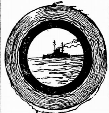
An Eye Placed at the Observing End of a Submarine's Periscope Sees a Ring-Shaped Image of the Horizon With Direct Image of One Part in the Center.

"Now, why deliberately irritate the cook, my dear?" "It is necessary, John. She has to whip some cream."