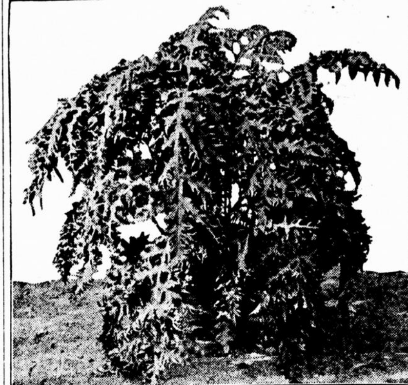
Specimen of Polypodium Mandalaunum.