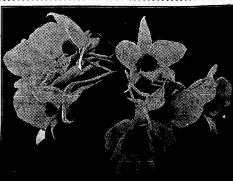
The New "Gardener's" Book

Use a sharp knife or scissors when gathering flowers. Gather them early in the morning and keep them in a large pall of water for some time before distributing them around the house in vases.