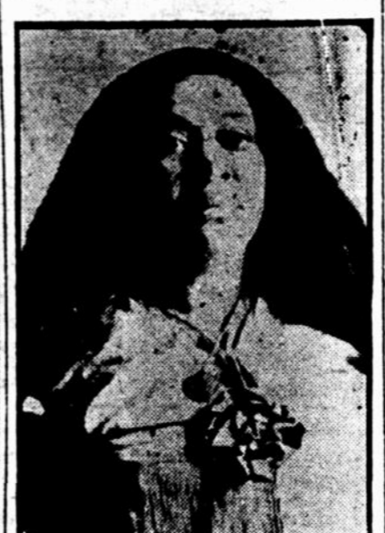
Woman's Crowning Glory is Her Hair