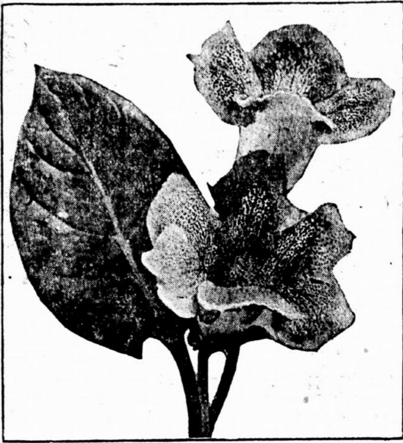
Drops of Water Must Not Be Permitted to Stand on the Leaves of Gloxinia, as Water Will Rot It.