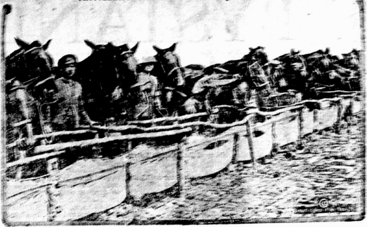
Official photograph taken during the British drive in France, showing artillery horses drinking from a trough.