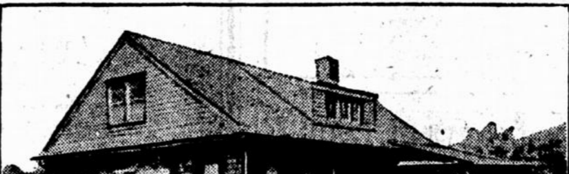
A Pretty Little Home That Has the Added Privilege of a Small Corner Victory.