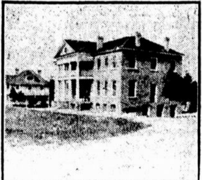
FRONT VIEW OF BOYS' DORMITORY.

"Wherever and whenever we can serve best, there let us be found. Our