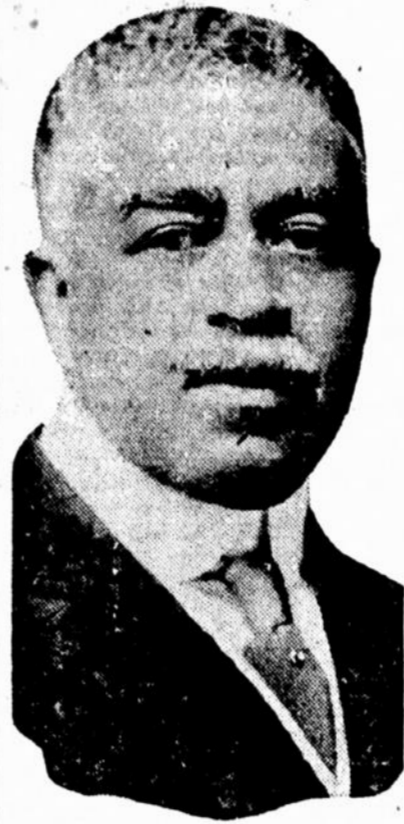
HENRY THACKER BURLEIGH

Winner of Spingarn Medal For Service to Race Is a Famous Musician.