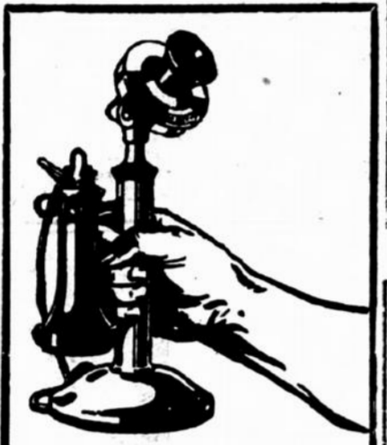
The Bell System —What It Is