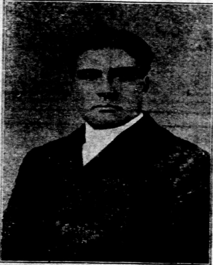
HON. H. P. CHEATHAM. This is a picture of Hon. H. P. Cheatham, the next to the last colored congressman that our race had. He was congressman from North Carolina.