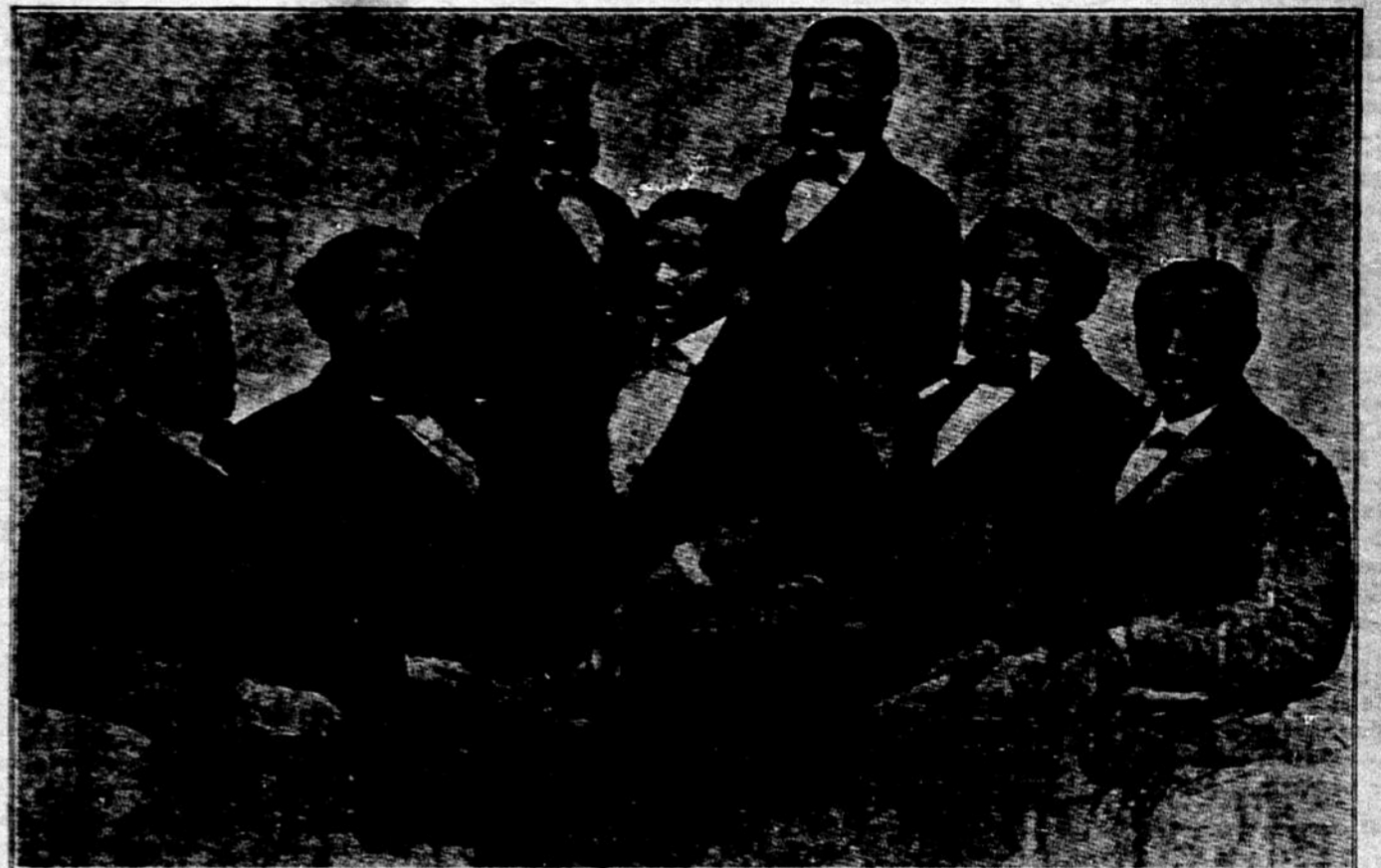
The above picture is a group of 5,000,000 Negro citizens Today we have 10,000,000 Negro citizens and after this great war the right of franchise will be extended to the Negro citizens in the south. They will not a single representative in either branch of our congress. We hope that again have colored men in congress.