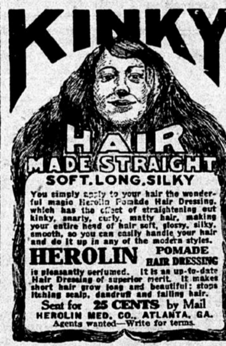
HEROLIN HAIR DRESSING