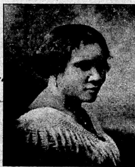
MADAM C. J. WALKER President of the Madam C. J. Walker Manufacturing Co., and the Lelia College, 640 North West Street, Indianapolis, Ind.

A Diploma From Lelia Col- lege of Hair Culture, is the Magic Key.