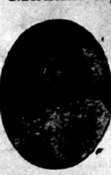
Madam M. Brooks Magic Hair Grower, Des Moines, Iowa.

This magic hair grower, scalp preserver and dandruff remover is one of the very latest on the market and it has been a wonderful success. It is sanitary, helpful and does not destroy the hair nor injure the scalp. It can be used without straight- ening irons. Price per box, 50c, and glo- sing for straightening, 35. Agents wanted in every city in the U.S. Write to