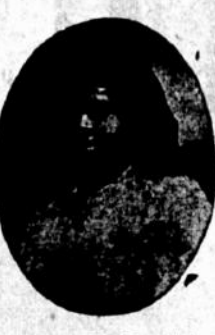
Madam M. Brooks Magic Hair Grower, Des Moines, Iowa.

This magic hair grower, scalp preserver and dandruff remover is one of the very latest on the market and it has been a wonderful success. It is sanitary, helpful and does not destroy the hair nor injure the scalp. It can be used without straight- ening irons. Price per box, 50c, and glos- sing for straightening, 35c. Agents wanted in every city in the U.S. Write to