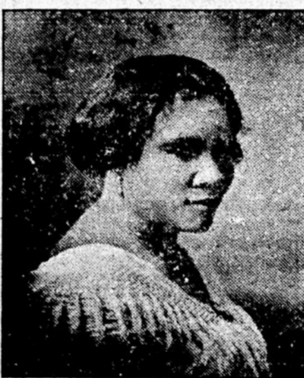
MADAM C. J. WALKER President of the Madam C. J. Walker Manufacturing Co., and the Lelia College, 640 North West Street, Indianapolis, Ind.

Just try it! Get three ounces of orchard white at any drug store and two lemons from the grocer and make up a quarter pint of this sweetly fragrant lemon lotion and massage it daily into the face, neck, arms and hands. It is harmless to whiten a dark skin.