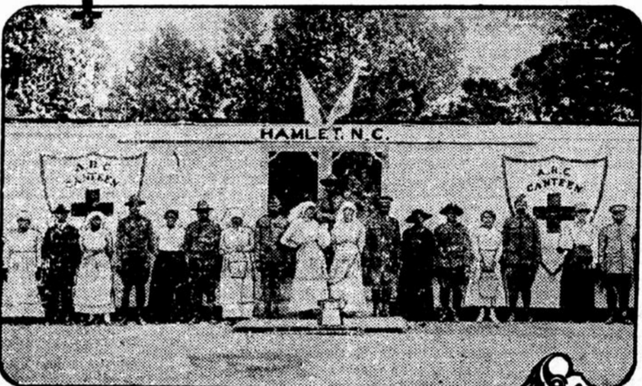
MANY OF THE AMERICAN RED CROSS CHAPTERS HAVE WELL-ORGANIZED NEGRO CANTEEN AUXILIARIES.

a point in the west. "And if it weren't for one thing I and my chum could come mighty near being happy now."