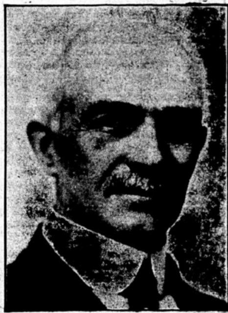
JUDGE J. E. MERSHON.

Government regulation for the conservation of paper cuts from our list all free papers. In this is included subscribers who are three months in arrears prior to November, 1917. If you are in this class you must pay at once. All subscriptions three months in arrears will be discontinued the last day of November. Do not wait for a collector, none will come. Do not depend on your former record for payment as the Government does not go back of one year. If you are in arrears, no matter who you are, your paper will be discontinued after the last day in November. Do not wait. Act now. Send your money direct to the BYSTANDER OFFICE. Do not wait to be dunned, but send in at once. This means every subscriber to The Bystander. The Government demands this, so act at once, right NOW.