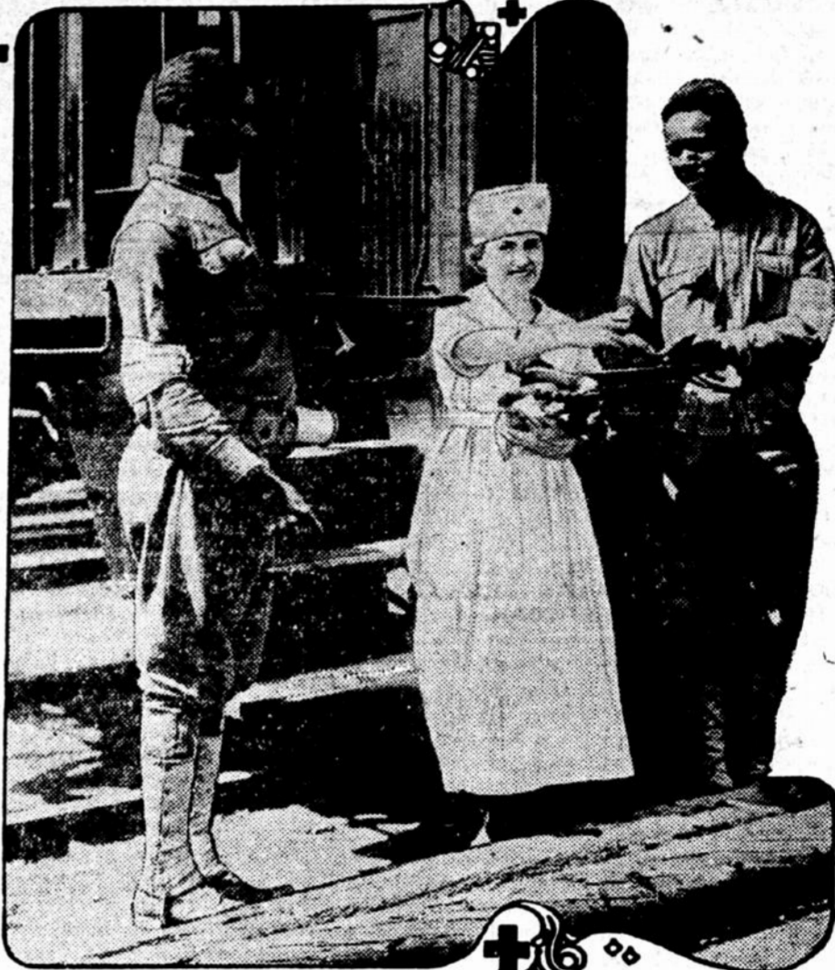
A SMILE IS THE PRICE HE PAYS FOR THESE BANANAS

"This is swell and helps a fellow a lot," said a big olive-dressed boy after partaking of canteen refreshments at