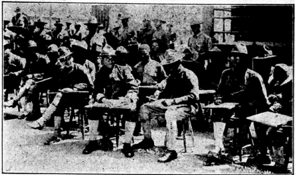
The above cuts are Companies Nos. 5 and 10, who were in the Ft. Des Moines Officers Training Camp at Des Moines. Receiving their commissions, they were assigned to command the 92nd Division, that went to France last May and performed heroic deeds, winning honors for their division, their country and their race. They are now returning to America. Their commanding officer said this division as a whole had the best trained officers of any colored division.

The supper given Saturday night at the Second Baptist church was well attended.