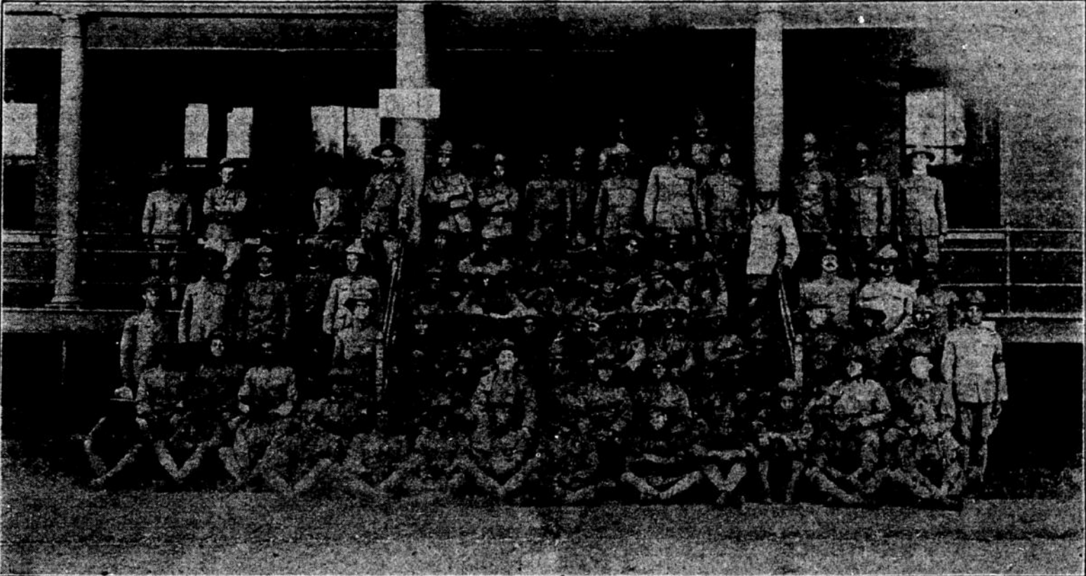
The above cuts are Companies Nos. 11 and 12, who were in the Ft. Des Moines Officers Training Camp at Des Moines. Receiving their commissions, they were assigned to command the 92nd Division, that went to France last May and performed heroic deeds, winning honors for their division, their country and their race. They are now returning to America. Their commanding officer said this division as a whole had the best trained officers of any colored division.