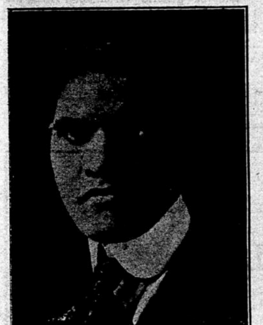
A COMING SINGER.