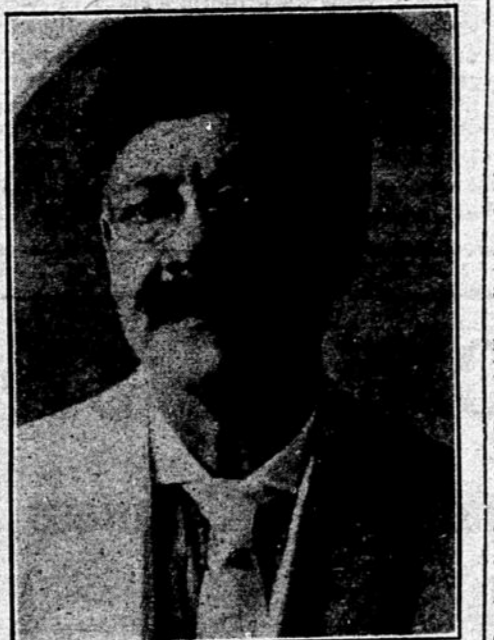
IOWA MAN MAKING GOOD IN THE WEST