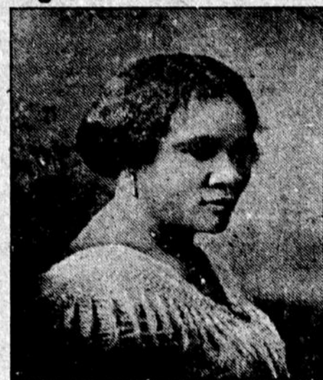
MADAM C. J. WALKER President of the Madam C. J. Walker Manufacturing Co., and the Lelia College, 640 North West Street, Indianapolis, Ind.