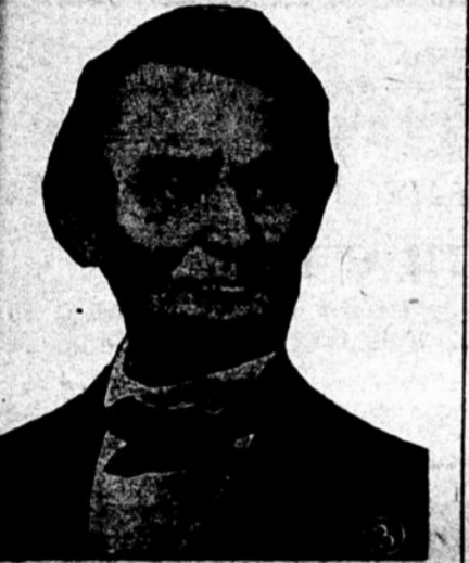
YOUNG ABE LINCOLN.