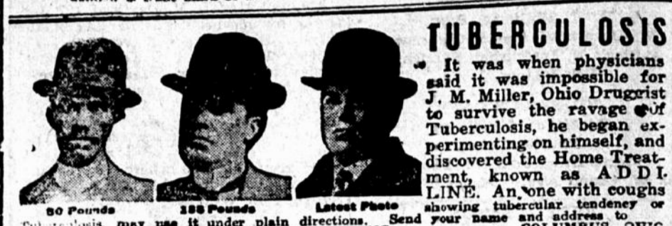
50 Pounds 100 Pounds Latest Photo

ache, Earache, Neuralgia, Lumbago, Rheumatism, Neuritis and Pain generally.