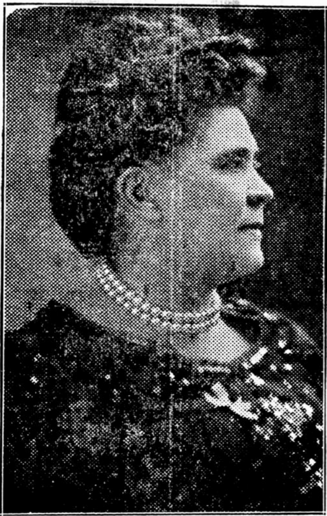
MISS HALLIE Q. BROWN.

Miss Hallie Q. Brown, lecturer, eloquent and editor, who was unanimously elected president of the National Association of Colored Women at their twelfth biennial session recently held in Tuskegee institute, Alabama.