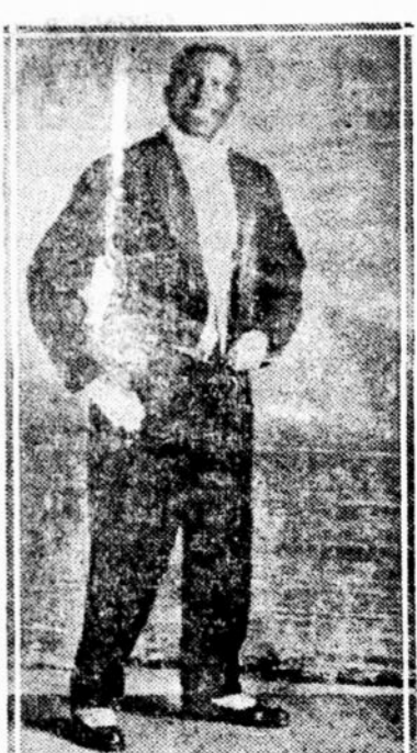
DES MOINES BOY MAKES GOOD IN THEATRICAL WORLD for $250.00 per week.