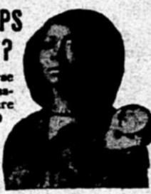
It grows mine. It will grow yours.