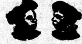
Before Using After Using

Not with hot irons. But do it with Kink-no-more, the greatest hair straightening preparation on earth. Kink-no-more will straighten the kinkiest kind of hair. Think about it—preparation that all you have to do is apply it on the hair, and, with a little combing, the hair becomes straight, not for one day, or one week, but to last from six to eight months. Water nor anything else will make it kink again after it has been straightened. Kink-no-more is a wonder-worker. So marvelous does it do its work that one can hardly believe their own eyes. It works like magic, and is unique because there is not another preparation in the world like it. We offer a reward of $100 for any head of hair that Kink-no-more will not straighten. Kink-no-more is a vegetable compound; it is perfectly harmless and will not injure the scalp nor hair, but will stop it from falling out; positively removes dandruff, promotes a luxuriant growth of healthy hair and keeps it soft and glossy. Remember that Kink-no-more is sold under a guarantee to do all that is claimed for it or money refunded. We will send to any one on the receipt of $1.00 a regular size box of Kink-no-more, enough to straighten from one to two heads of hair. When ordering send registered letter, postal money order or express money order. Liberal inducements offered to agents. Write today for special terms of getting out of stamp for reply. Agents wanted everywhere. Address: Prof. L. F. Shelton, 1138 East Tenth Street, Los Angeles, Cal.