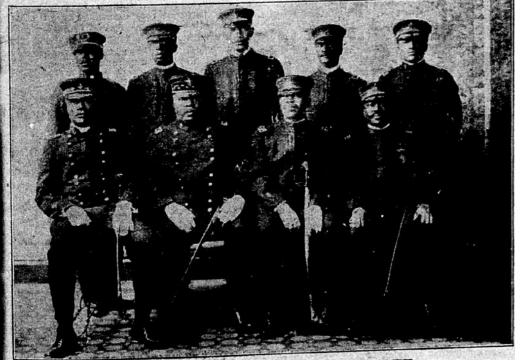
PAST BRIGADIER GENERAL AND STAFF