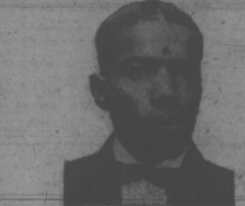
LET'S GET ACQUAINTED!