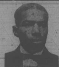
LET'S GET ACQUAINTED!

It was an invention of a genius, although a prehistoric one—a priest—who conceived the idea of miniature gods, who acted out the story of the religion he served.