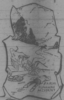
FARM RUNAWAY ACCIDENT