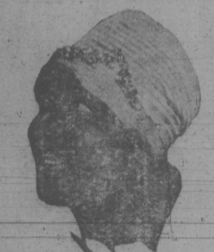
BESSIE SMITH Heads Bill At Lincoln Theatre

A unique departure in the field of talking picture features is the musical drama, "St. Louis Blues," coming Sunday, April 6, to the Lincoln Theatre. Adapted from the famous song hit of the same name by W. C. Handy which revolutionized popular music in this country, the picture presents a powerful, dramatic little tale of New York's Black Belt—Harlem.