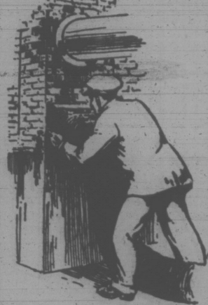
Removing Soot Accumulations From the Chimney is No Longer a Dirty, Messy Job. A Giant Vacuum Cleaner More Thoroughly Cleans the Chimney Than is Possible by Hand.

For safety and economy, the heating system should be cleaned each spring as soon as the heating season is over, says the Holland Institute of Thermology of Holland, Mich. Ashes, soot and dust should be removed from chimney heater and flue pipe, and heat ducts and cold-air returns should be clean and free from obstructions. If the heating plant is not thoroughly cleaned when the fire is discontinued, soot and ash particles which absorb moisture from the air, corrode or rust the inside of the flue pipe, reducing its thickness beyond the point of safety before the outside surface