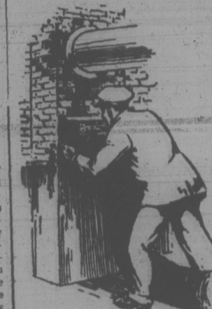
Removing Soot Accumulations From the Chimney is No Longer a Dirty, Messy Job. A Giant Vacuum Cleaner More Thoroughly Cleans the Chimney Than is Possible by Hand.

For safety and economy, the heating system should be cleaned each spring as the heating season is over, says the Holland Institute of Thermology of Holland, Mich. Ashes, soot and dust should be removed from chimney heater and flue pipe, and heat ducts and cold-air returns should be clean and free from obstructions. If the heating plant is not thoroughly cleaned when the fire is discontinued, soot and ash particles which absorb moisture from the air, seep into the inside of the flue pipe, reducing its thickness beyond the point of safety before the outside surface