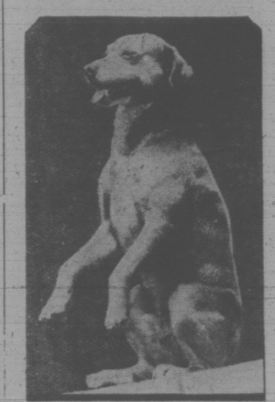
The Early Training of a Dog Is Most Important.

A properly trained dog is a delight to himself and his master. He loves to do his master's bidding, and were every dog well-trained, there would be little complaint about dogs and their deeds, states the Chappel Kennel Foundation, Rockford, Illinois. Probably 95 per cent of dogs have the ability for training and only require effort, patience and repetition to bring it out of them.