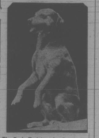
The Early Training of a Dog is Most Important.

A properly trained dog is a delight to himself and his master. He loves to do his master's bidding, and were every dog well-trained, there would be little complaint about dogs and their deeds, states the Chappel Kennel Foundation, Rockford, Illinois. Probably 95 per cent of dogs have the ability for training and only require effort, patience and repetition to bring it out of them. The early training of a dog is most important. A dog not trained or disciplined during the first twelve months of his life, will not be nearly as manageable and dependable when grown. Only one person should be the dog's instructor during the entire course of