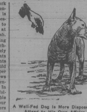
A Well-Fed Dog is More Disposed to Attend to His Own Affairs.

and the instant he moves to take a piece of refuse or garbage, command "No" and move toward him. It will not be long before the dog will understand what you are driving at, and your worries in this respect will be over for good. The day in which the dog was looked upon more or less as a garbage can has definitely passed. Nevertheless, the Foundation, a number of incidents reported recently indicate that there are still on the market dog foods which will not only sicken the animal but menace the health of the children of the household. As safeguard and protection to both dog and owner, therefore, the Foundation urges that no canned dog food be used that does not have the wording, "U. S. Inspected and Passed by the Department of Agriculture" on the label.