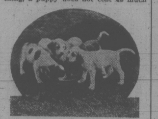
Eating is the Biggest Thing in a Puppy's Life.

Dog or puppy? The choice of one or the other must be made by everyone who contemplates adding a canine pet to his household, states the Chappel Kennel Foundation, Rockford, Illinois. While some prefer a perfectly-trained grown dog, most people are inclined to agree with Albert Payson Terhune that a puppy is more desirable. For one thing, a puppy does not cost as much