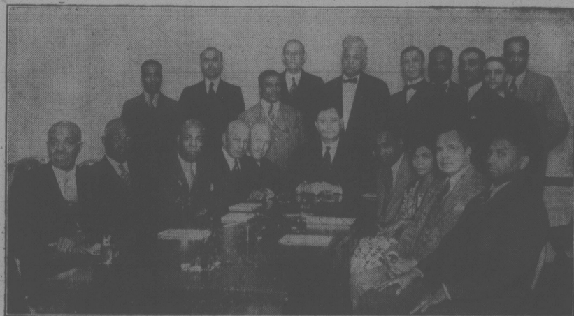
NATIONAL COLORED PLANNING BOARD MAPS HOOVER CAMPAIGN