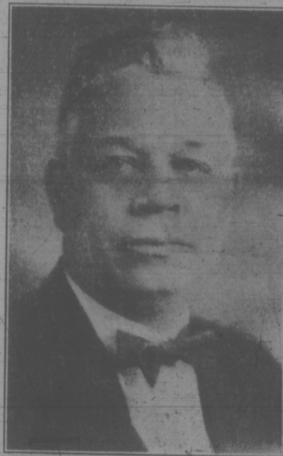
REP. OSCAR DE PRIEST