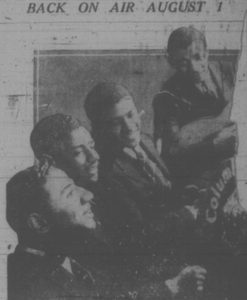
With John Mills, bass singer and guitar player rapidly covering from his illness, the Mills Brothers have been advised by their physician that they will be able to resume air work August 1. Thousands will await their return.