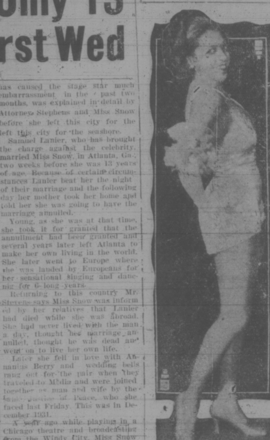
Miss Valaida Snow, who in an interview with newspapermen last week, said she had been held under bond in Me. Pa. on bigamy charges, declared that she was just a victim of circumstances. The outcome of the case will be eagerly watched.