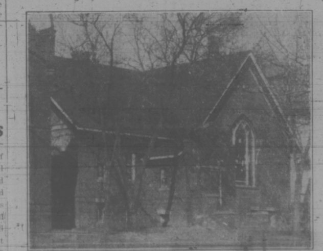
BURNS M. E. CHURCH