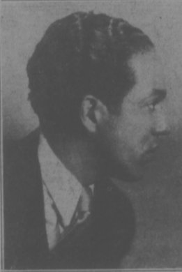
LANGSTON HUGHES "School Board Refuses Him"