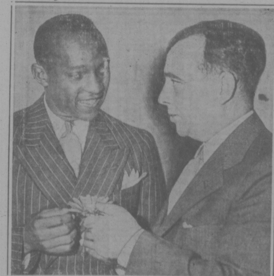
JESSE OWENS, 1936 Olympic Champion, internationally known Negro athlete, receiving a Kansas Sunflower from Republican Eastern Campaign Manager Joseph W. Martin at Republican National Committee Headquarters.

"Specifically bespeaking groups of colored American citizens to aid the fight of the Republican Party, we say to the colored youth of America that its only hope for realizing the career to which American life and opportunity entitles it is to join this crusade