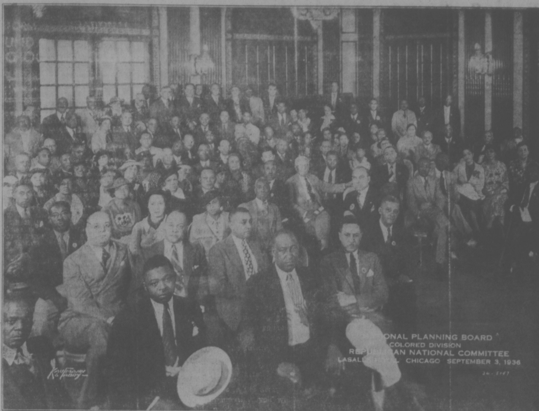
A glimpse of the meeting of the National Planning Board of the Republican Party's Colored Division, comprising leaders from every section of the country, photographed

"The picture of the omissions and injustices of the Democratic Party