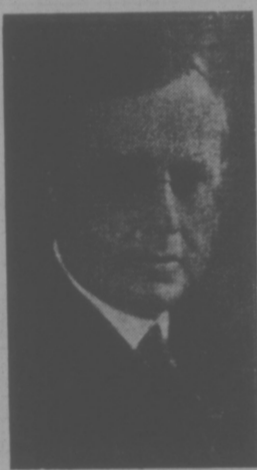
Gov. Alf M. Landon (above) addressed an enthusiastic gathering Tuesday, when two thousand Negroes attended at the state fair grounds.