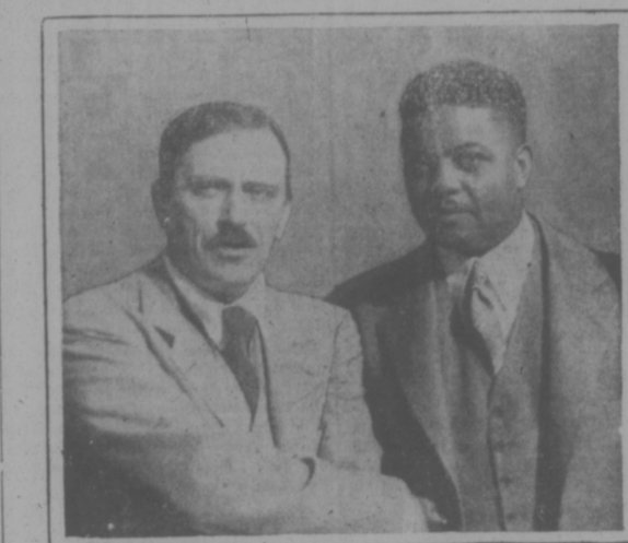
Earl Browder and James W. Ford (above), standard bearers of the Communist party, who are vigorously carrying the fight for Negro rights into the south by radio and personal appearance speeches. In Birmingham, Ala., last week Browder denounced lynch-oppression and called on Negro and white toilers to unite, and local mill owners and landlords.

Ford is scheduled to speak in Des Moines at East High school Friday evening. He was heard over a national radio network Monday.