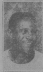
BY ALLEN ASHBY