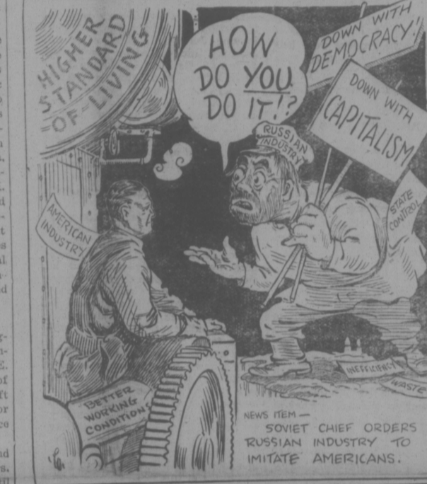
NEWS ITEM—SOVIET CHIEF ORDERS RUSSIAN INDUSTRY TO IMITATE AMERICANS.