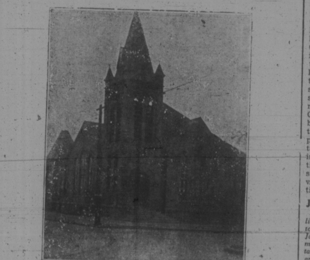
CORINTHIAN BAPTIST CHURCH