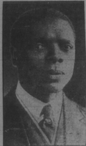
DR. WILLIAM PICKENS

William Pickens, Field Secretary of the National Association for the Advancement of Colored People, who is appearing on the Des Moines Public Forums, was born in South Carolina. From high school in Little Rock, Ark. as the valedictorian of his class he entered Talladega College in Alabama and finished the Bachelor of Arts after which he entered Yale University receiving the degree of A. B., the Phi Beta Kappa key and rank in the Philosophical oration group, the highest-ranking group in his class. In his career as a teacher he received the following honors: a diploma from the British Esperanto Association; Master of Arts from Fisk University, Litt D from Selma University and L. I. D. from Wiley.