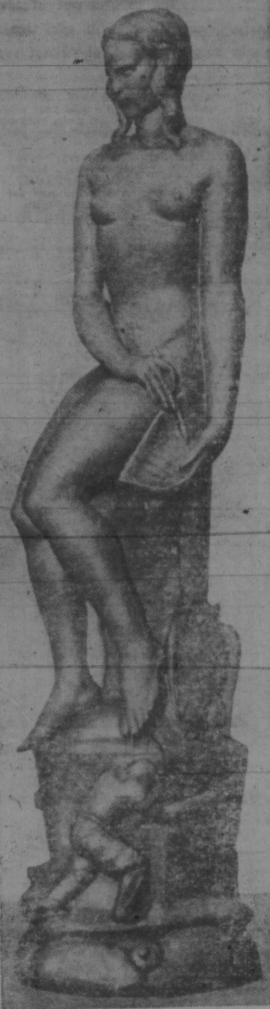
NEW YORK—Portraying "the unadorned truth," this statue will be dedicated to the constitutional right of freedom of the press in the "Four Freedoms" statuette group on the "Mall of the New York's Fair 1939.