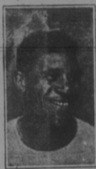
BY ALLEN ASHBY