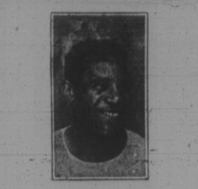
BY ALLEN ASHBY