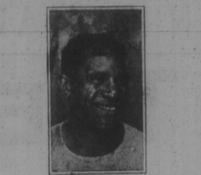
BY ALLEN ASHBY FOOTBALL SEASON

FIRESTONE SERVICE STORES Tires, Tubes, Radios and all Auto Accessories -Use Our Budget Plan- 10th & Locust Ph. 3-8171