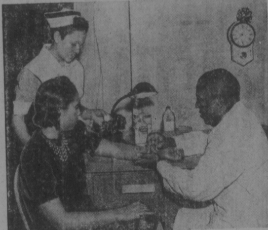
Doctor giving tuberculin test to young girl, above to find out if tuberculosis germs are present in her body. The test is one means of discovering tuberculosis in its early, most easily curable stage.