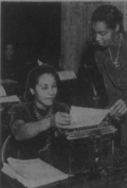
Girl, above, recovering from tuberculosis, learns to typewrite so she can take her place in the community as a healthy, wage-earning person.