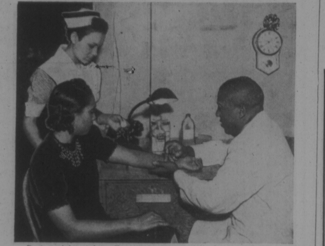
Doctor giving tuberculin test to young girl, above, to find out if tuberculosis germs are present in her body. The test is one means of discovering tuberculosis in its early, most easily curable stage.