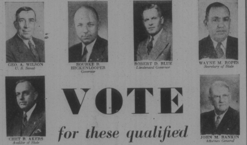
GEO. A. WILSON U. S. Senator