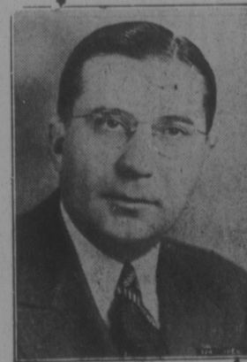
GEORGE FAUL State Senator Buy War Bonds-Stamps