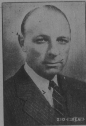
B. B. HICKENLOOPER Lieut. Gov. Bourke B. Hickenlooper of Cedar Rapids, Republican candidate for governor, won a victory over former Gov. Nelson G. Kraschel, Democrat.