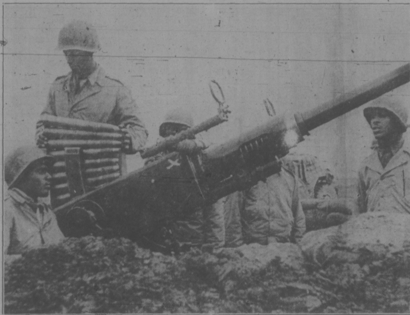
RECENTLY RELEASED photos of the 450th Antiaircraft Artillery Automatic Weapons Battalion Fifth Army in Italy. The small plane painted just below the sight support in upper photo is emblematic of this crew's victory over an enemy craft. Business-like gunner in lower photo (with Fifth Army insignia displayed on left shoulder) is representative of the well-disciplined soldiers of the Fifth.