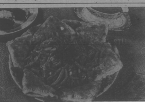
Potato Tarts with Sausage Filling

There are few meals as time-releasing and fuel saving as oven meals. They are a boon to the busy housewife, who can put food in the oven and leave it for a specified length of time, confident that the controlled heat of modern ovens will stay constant.