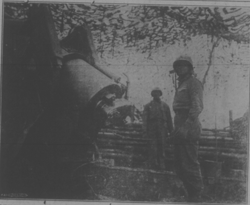
SENDING SHELL DOWN UNDER DEN LINDEN?—No, this 8-inch howitzer of a Negro field artillery battalion is about to be fired on Nazi position in support of the 90th Division infantry, who are storming the Siegfried Line. This cannon is emplaced on German soil.